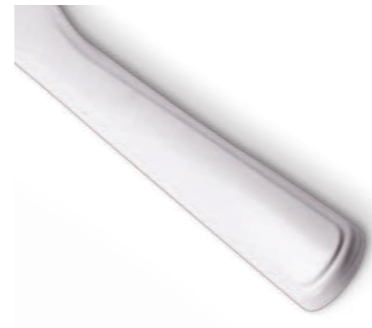
grooves for extra stability